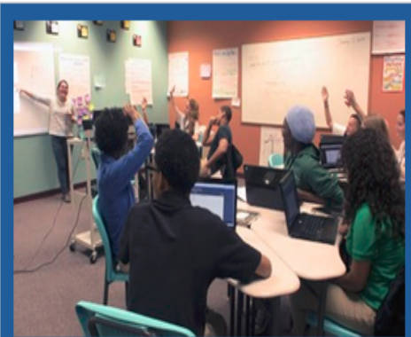
Students get some face-to-face help from a teacher in the Village Green Virtual School Learning Center.

Students move at their own pace toward mastering standards and college and career readiness.